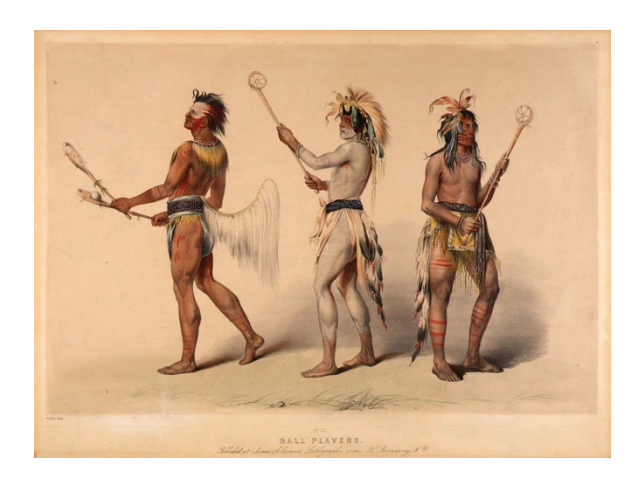
Figure 1. Ball Players. George Catlin. Date unknown.

The outcome of the game, as well as the choosing of teams, was thought to be controlled supernaturally. As such, game venues and equipment were prepared ritualistically.